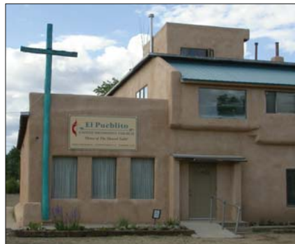
Shared Table ministry, 1309 Paseo del Pueblo inside El Pueblito UMC, Taos, N.M. 87571, 505-758-3166

An investment fund was established through the New Mexico Conference Methodist Foundation to help support Shared Table's ministry.